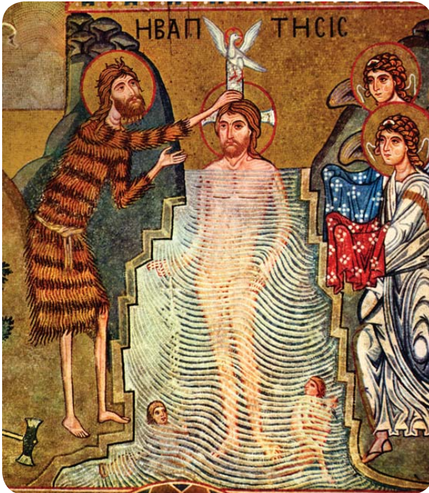
Mid 12th Century mosaic in the Palentine Chapel , Palermo, Italy